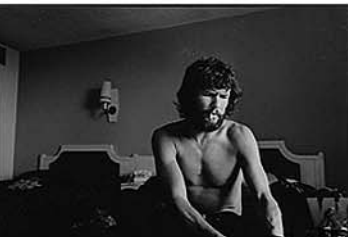
1 Kris Kristofferson of the Avant-Garde 3.31