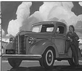
3 California Pink-A-Pades 7.00