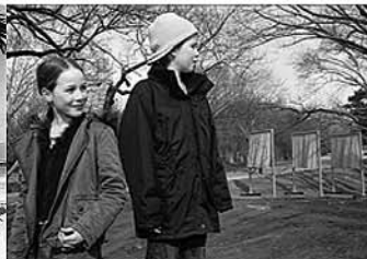
8 Younger Critics of New York 0.40