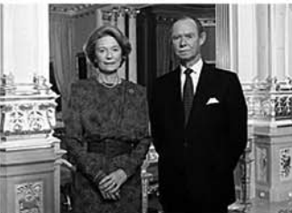
5 Grand Ducal 3.07