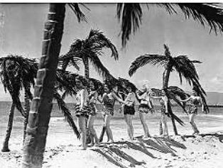
7 Encounter with Remarkable Trees 3.25