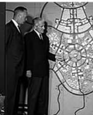
2 The Irvine Master Plan 1.43