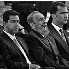
6 Sleepy Bullet 6.57